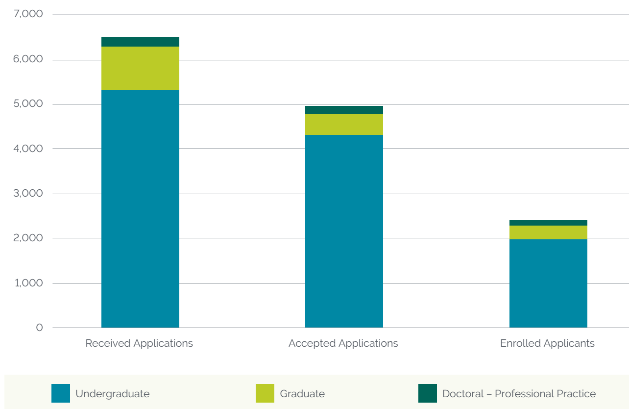
Student Admissions by Level